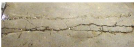
CRACKING & DETERIORATION OF SLAB TOP SURFACE