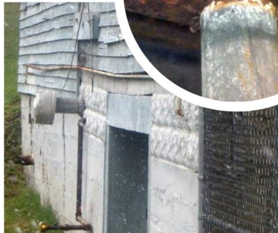
SIGHTING ALONG EAST FLOOR SLAB EDGE