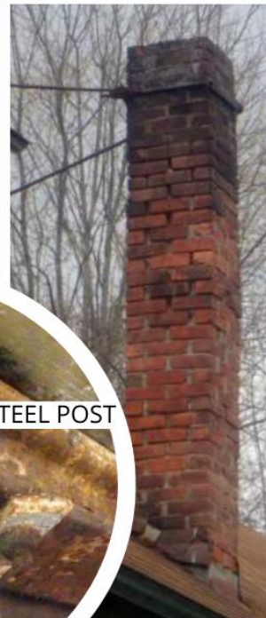
DETERIORATED BRICK CHIMNEY