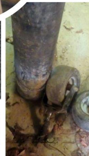
BOTTOM OF CENTER STEEL POST