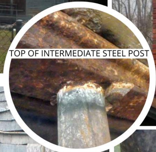
TOP OF INTERMEDIATE STEEL POST