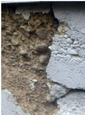
DETERIORATION OF OUTSIDE FACE OF CONCRETE WALL