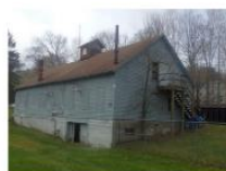
OCSD GREY BARN, 2021