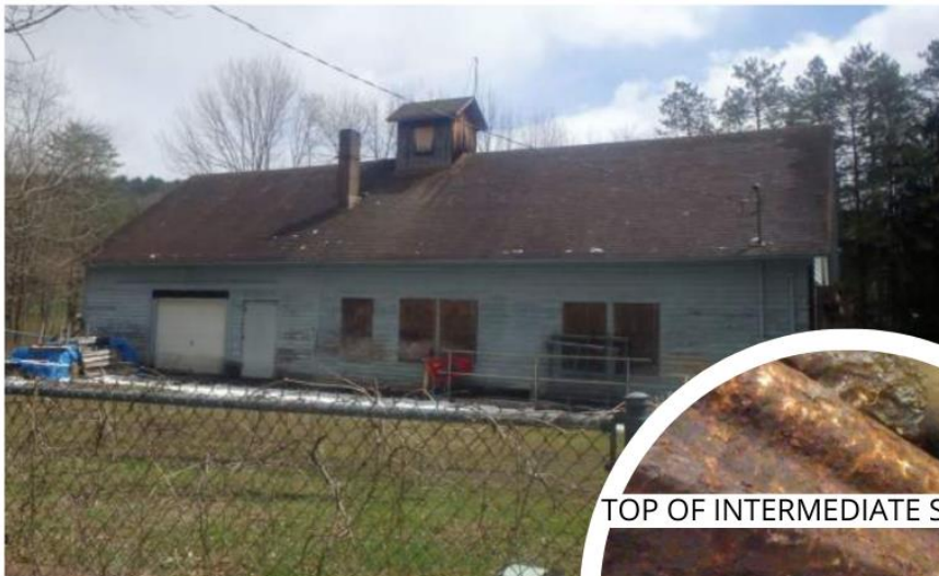
EXTERIOR OVERVIEW FROM THE WEST

Klepper, Hahn & Hyatt, a Structural Engineering firm from East Syracuse examined the Grey Barn and had numerous concerns. The engineers located many areas of cracked concrete flooring as well as many areas where the concrete has broken into smaller pieces. The structural support beams for the barn floor have rusted and have resulted in the concrete around cracking and falling apart. This report revealed extensive rust throughout the flooring system and the posts that support the floor. The engineer cited “irregularities” with the original construction techniques as they are no longer accepted in the building industry. The masonry chimney as well as the basement walls were easily chipped away during the inspection raising concern for the building’s prolonged usage. The extensive cracks in the foundation were also deemed as areas of increased water infiltration. The building has simply outlived its useful life. Below please find some photos shared during the inspection by the structural engineers: